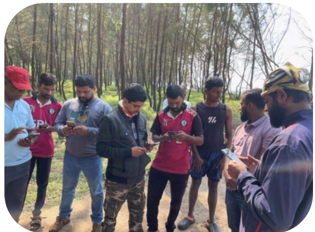
m-Turtle Application Training and Demonstration